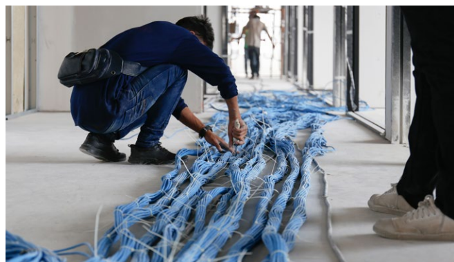
Figure 1 · Typical Legacy Chollenges